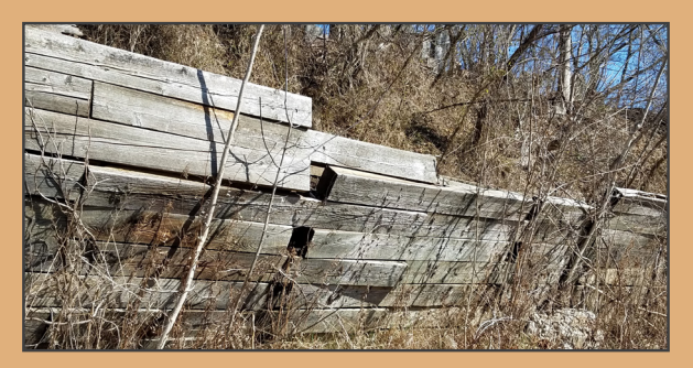
Before images of a wall that needed replaced at Shaare Zedeck.