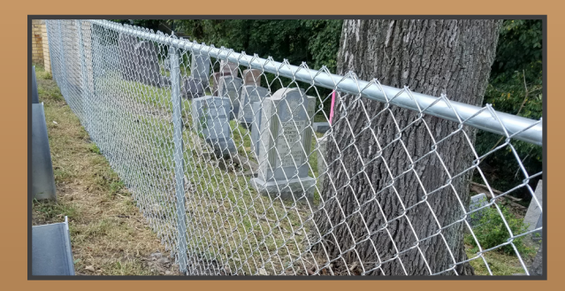
Replacement of collapsed fence at Workmen's Circle #975.