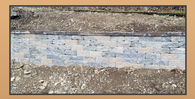
New wall built at Shaare Zedeck.