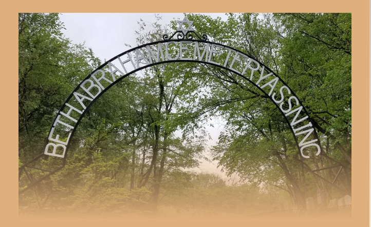
Refurbished archway at Beth Abraham Cemetery

Your Promise: to create a legacy of care that others will follow.