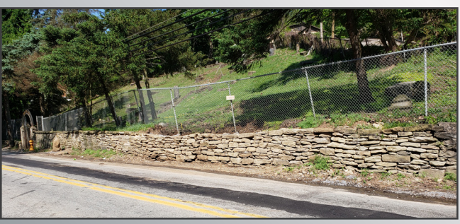
New wall at the historic Old Chesed Shel Emeth Cemetery