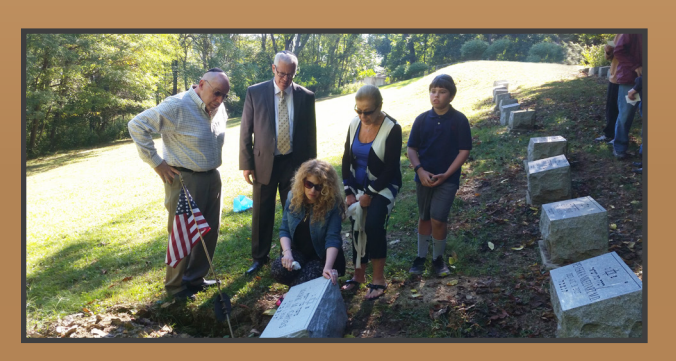
Please consider a Planned Gift to the JCBA.

For more information about Planned Giving visit us online at WWW.JCBAPGH.ORG